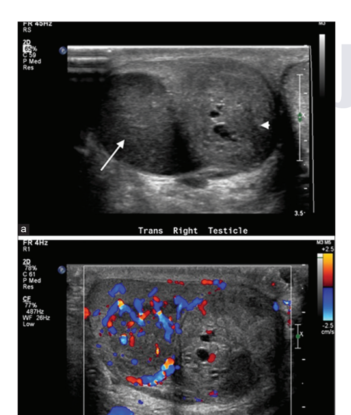
Figure 1: A 40-year-old male with synchronous testicular tumors. (a) Gray scale US of the right testis demonstrates two intratesticular masses. There is a solid hypoechoic mass that measures 3.3 cm (arrow) and a heterogeneous, slightly hypoechoic lesion with cystic changes (arrowhead) that measure 2.6 cm. (b) Color Doppler demonstrates increased vascularity in the solid mass. The mass with cystic changes is relatively hypovascular.

Ultrasonography (US) of the scrotum demonstrated two solid right intratesticular lesions (Figure 1). The first lesion was a 3.3 \times 2 \times 1.8 cm hypoechoic solid mass. The second lesion was a heterogeneous, slightly hypoechoic lesion that demonstrated cystic changes and measured 2.6 \times 2.1 \times 2.4 cm. Color Doppler showed internal flow in both lesions, greater in lesion one than in lesion two. The right testis measured 2.6 \times 3.9 \times 4.3 cm. There was no intratesticular mass in the left testis. Chest X-ray showed no evidence of disease. No other pre-operative imaging workup occurred.