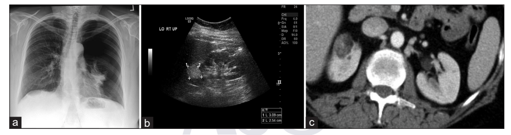
Figure 1: 51 year old female with Birt-Hogg-Dube Syndrome. (a) Chest radiograph demonstrates a large left pneumothorax. (b) Grayscale longitudinal plane image demonstrates a 3.1 × 2.5 cm well circumscribed hyperechoic lesion in the upper pole of the right kidney suggestive of Angiomyolipoma (AML). (c) Axial contrast enhanced image demonstrates corresponding hypoattenuating lesion containing macroscopic fat compatible with AML.

BHD is an autosomal dominant hereditary syndrome that arises due to a mutation in the FLCN tumor suppressor gene.